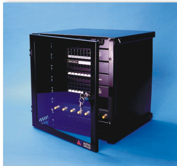
MiniPatch V2, plain door style

A wide range of accessories is available for the MiniPatch allowing it to be used for many applications including PBX, Ethernet, Token Ring and ISDN. (See below for details)